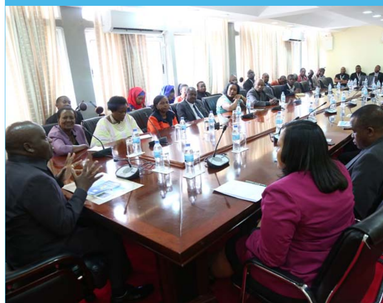
Speaker of National Assembly Hon. Job Ndugai speaking with the Women Parliamentary Group (TWPG) during the special seminar empowered by LSP II in Dodoma, April 2018.

There are several All-Party Parliamentary Groups (APPGs) in the National Assembly. They bring together MPs and other stakeholders who have an interest in thematic areas such as gender equality and women's empowerment, environment, youth empowerment, HIV and AIDS, and the fight against corruption, to name but a few. These groups are important forums for discussion and analysis of major development questions among MPs, CSOs and academics in a non-partisan manner. Through knowledge and information sharing, they can influence the quality of debates both at the committee and plenary level