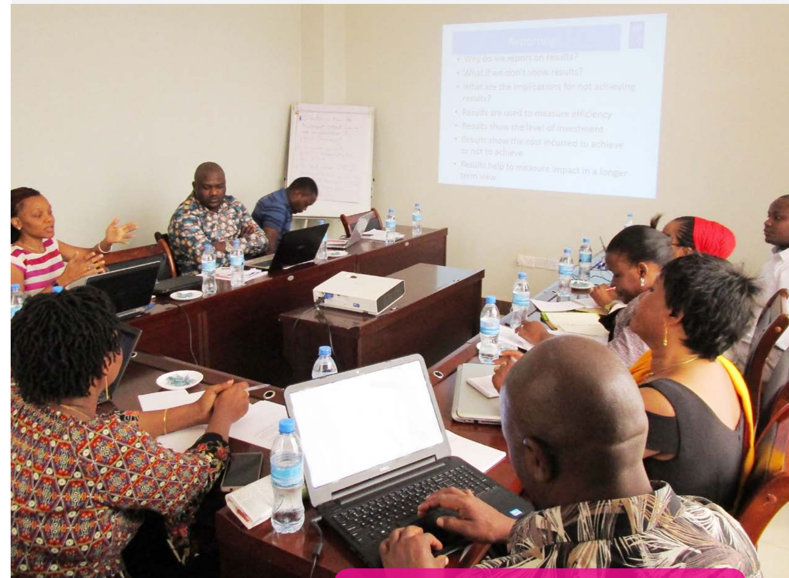
Project Unit team from UNDP and National Assembly in meeting