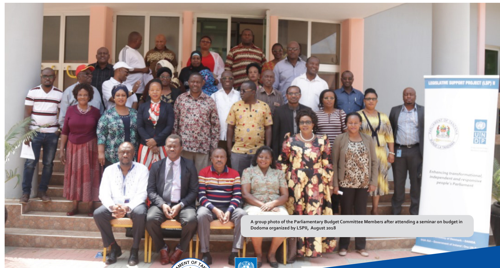
A group photo of the Parliamentary Budget Committee Members after attending a seminar on budget in Dodoma organized by LSPII, August 2018