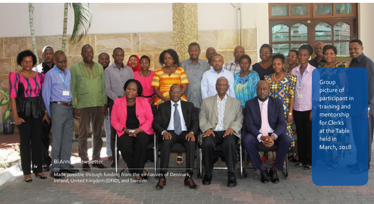
Group picture of participant in training and mentorship for Clerks at the Table held in March, 2018