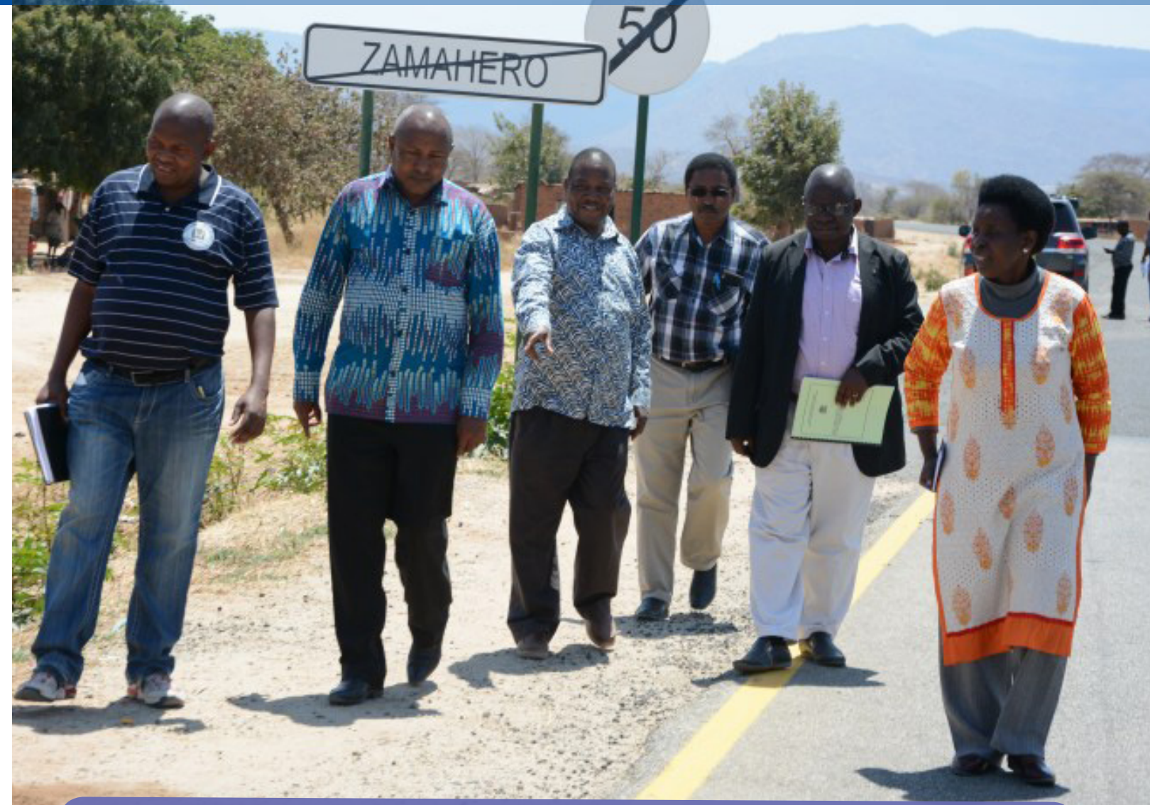
Field Visit - Members of Infrastructure Development Committee pay a Visit to Road Construction of tarmac road, Dodoma City - Bonga, the Project Supported Visit.

As part of the process to develop field visit guidelines, the project supported field visits to two major projects. The Infrastructure Development Committee visited the construction of a tarmac road from Dodoma town to Bonga; while the Land, Natural Resources and Tourism Committee and Public Investments Committee inspected work on the Iyumbu Satellite Town in Dodoma Municipality. Significantly, the Minister of Infrastructure, Transportation and Communication was present during