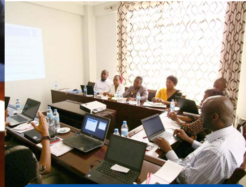
Strategic Retreat Meeting underway in Morogoro, May 2017

underscored the importance of the project in improving the capacity of the National Assembly and its members and staff in such areas as review of bills and the budget as well as undertaking oversight of government ministries, departments and agencies. He also thanked the development partners for their support to the project and requested them to continue supporting the project for the benefit of the Parliament and other stakeholders.