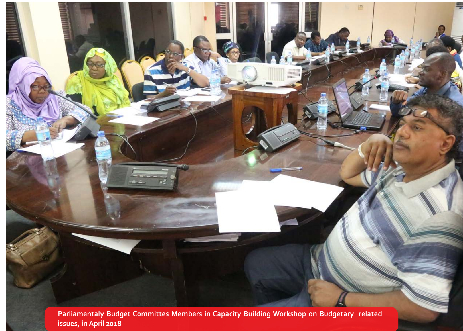
Parliamentary Budget Committee Members in Capacity Building Workshop on Budgetary related issues, in April 2018

The Project Director, who is also the Clerk of the National Assembly, has established a project implementation unit comprising National Assembly staff. The unit which is headed by a Project Coordinator is responsible for the design and implementation of project activities. A UNDP-recruited project Chief Technical Advisor (CTA), and Monitoring and Evaluation (M & E) Specialist, provide technical support to the project. In the design and implementation of activities, heads of departments and units in the National Assembly, as well as chairpersons of committees and committee clerks, are also involved. An M & E task force has also been established to facilitate data collection and reporting on progress towards results.