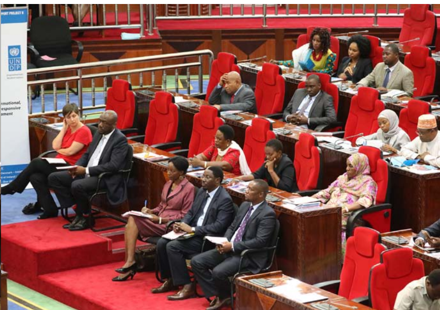
A Cross Section of Members of Parliament & LSP Team during the launching of Legislative Support Project Phase II in Dodoma Sept, 2016